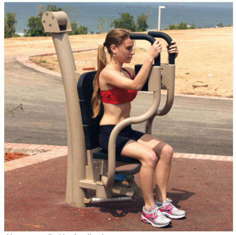
User controlled hydraulic piston