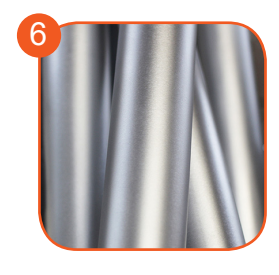
Solid construction made of stainless steel AISI 304 totally resistant to weather conditions. Solid construction made of stainless steel AISI 304 totally resistant to weather conditions.