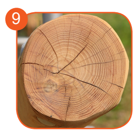
Natural Robinia logs from European plantations. The wood has a FSC certificate, which ensures that products come from responsibly managed forests.