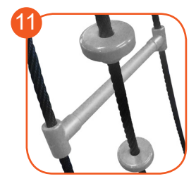
Rope ladder steps and rope knots made of injection molded polyamide.