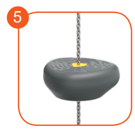
The passage module is ma of a 6mm stainless steel chain, 15 mm thick HDPE boards and an 18 mm thick HDPE non-slip HDPE board.