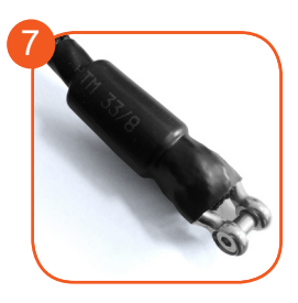
Rope endings pressed in a sleeve made of durable aluminum alloy.