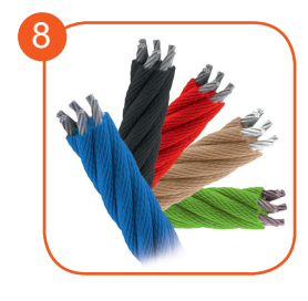
Polypropylene ropes ppmultisplit type with a steel core and a diameter of 16 mm.