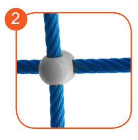
Solid and esthetic rope connectors made of injection molded polyamide.