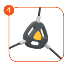
Handle made of rotomoulded LDPE type material