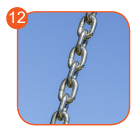
Attested 6 mm stainless steel chains.