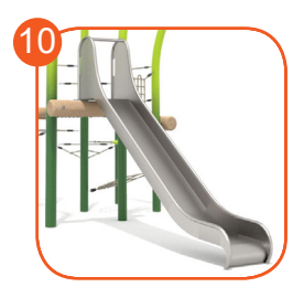
Slide made of stainless steel AISI 304. The metal sheet is 2 mm thick and the end section is finished with a band made of pipe 33,7 mm.